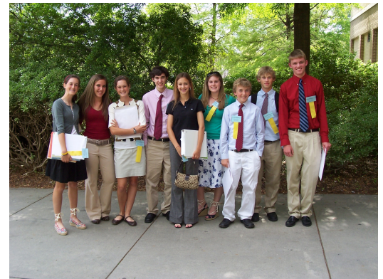
SCJAS Annual Meeting participants