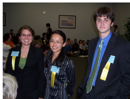
SCJAS Annual Meeting presenters